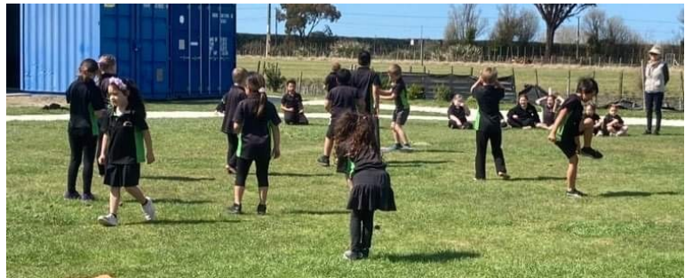
Football with Moananui