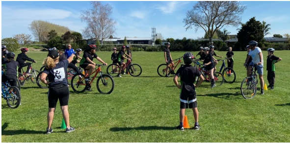
Biking with Papakura

A busy afternoon for our classes on a sunny Tuesday afternoon!!