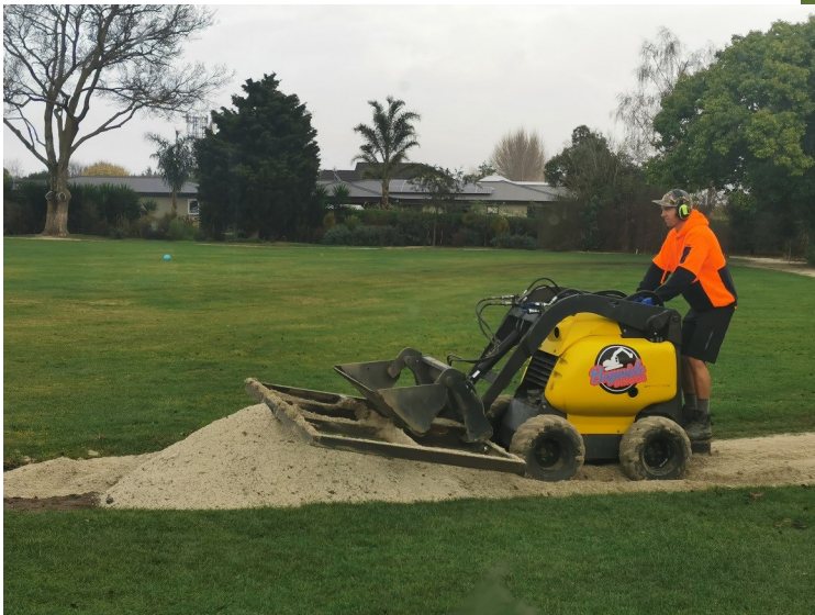
The dingo looked like fun to have a play on. He made it look easy levelling out the track.