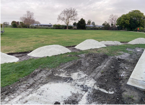
At the start of the day

We are very excited to see our bike track going back in to-day. We look forward to the children getting back on the bikes and enjoying this amazing track we have.