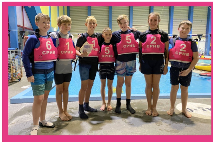
2nd Place HNI Blacktips