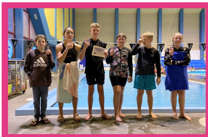
1st Place Meeanne Maestros